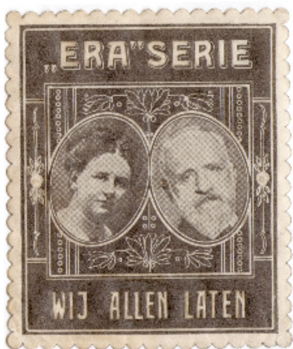
Queen Wilhelmina and Pieter Cort van der Linden (Color: Black)