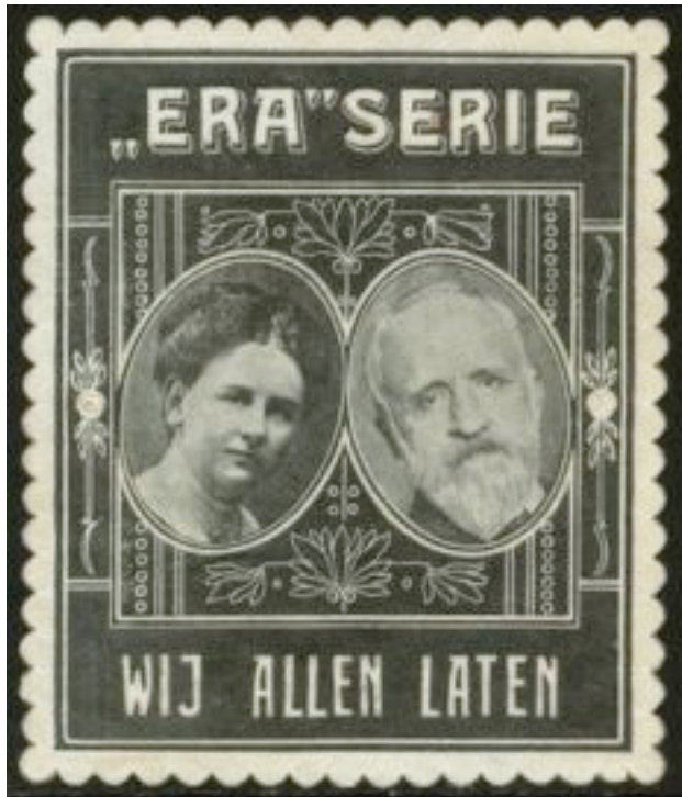
Illustr.#1 Queen Wilhelmina and ?